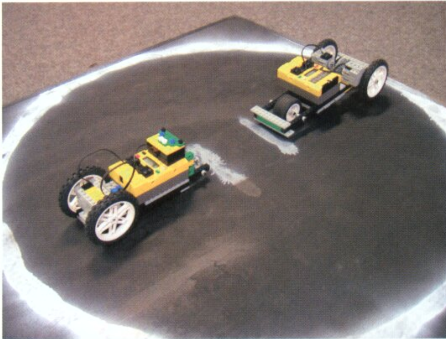
The students were required to create a robot capable of taking part in a Lego Sumo Bash.