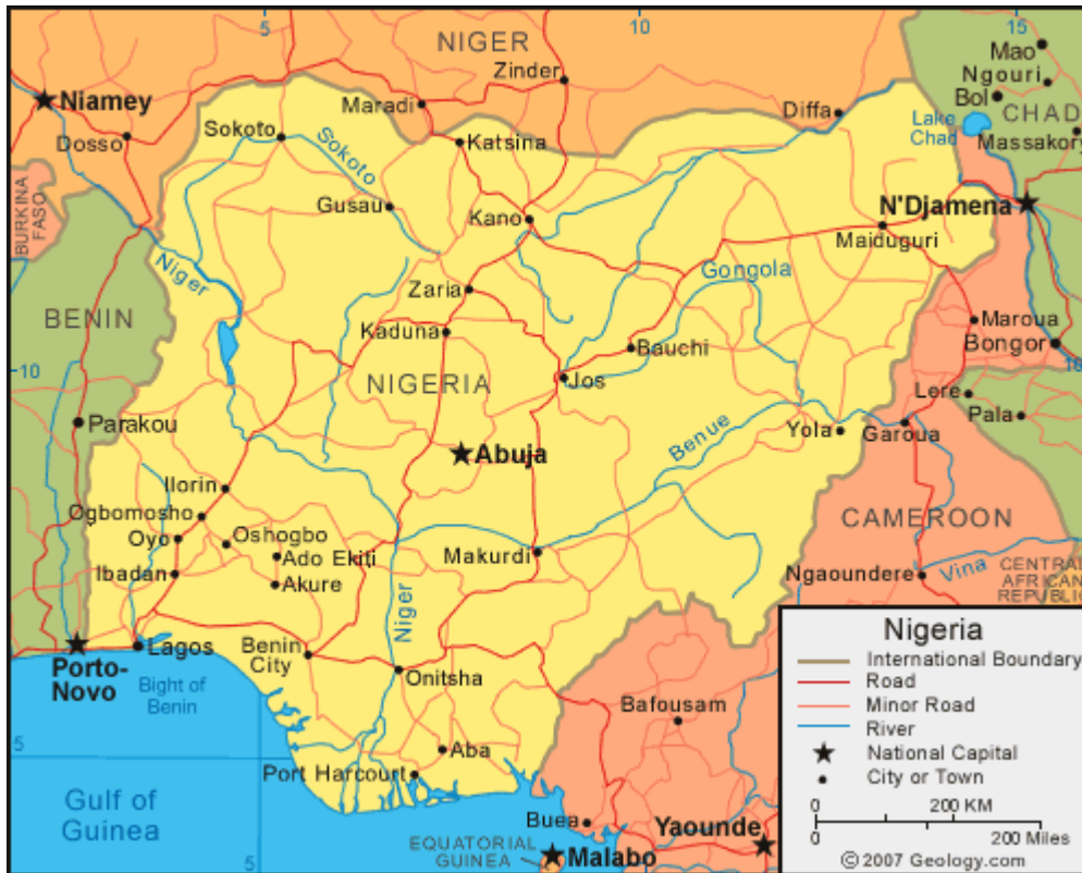
Fig 2.1 Map of Nigeria

shows the map of Nigeria detailing some cities and boundary with other neighbouring countries.