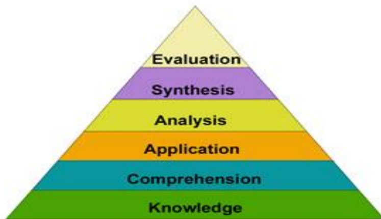
Figure 4.2: Bloom's Taxonomy of the Cognitive Domain Source: Engelhart et al, (1956) Taxonomy of educational objectives: The classification of educational goals. Handbook I: Cognitive domain.

domain within the educational settings. However, Kearsley (1994) expanded these into specific behaviours at each level and the descriptive verbs used. These are as shown in figure 4.2