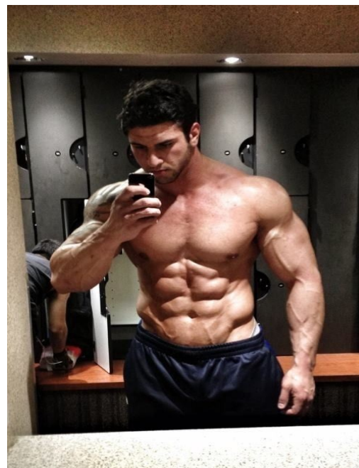
Figure 16: Gym Self Photograph(Motorcat, 2013)

As discussed in the previous chapter, narcissism has been coupled with the self promoting convention of Facebook. Those who avail of Facebook in order to popularize their image often foster narcissistic characteristics, with individuals prone to flaunt their narcissism through the use of imagery on social media. Reider(2014) in a recent study argues that those who commit themselves emotionally to Facebook where more disposed to body apprehension, by which the narcissistic traits are serving as a catalyst for consciousness on a physical level. Rosen revealed that the imprudent use of Facebook exacerbates the narcissistic element of one's personality, merely by engaging with self promotion or exhibitionism (Science Daily, 2011). Contradictory to those with bodily discontent, the narcissist has an unashamed illustration of their own body and are subject to facets of vanity. Egan & Mccorkindale(2007, Pg. 2106) affirm: