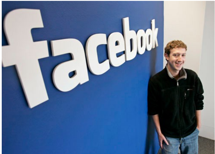
Figure 7: Facebook Creator Mark Zuckerberg (Lewis 2012)

This chapter will illustrate the cognitive behaviours generated with the adoption of a social media lifestyle. Through this process, a profound comprehension of how these behaviours may contribute to body hesitancy will be attained. Amidst a coherent awareness of the aggrandizement of the ideal male form in Western media in recent decades, a clearer recognition of social media, namely Facebook, needs to be ascertained. Facebook was predominantly founded by Mark Zuckerberg on February 4th 2004 and had a notable effect on the sociological zeitgeist, with the installation of many new methods of social interaction (Phillips, 2004)(Figure 7). The magnitude of people a member could interact with eclipsed the basic forms of physical social interaction that had been conventional up to that point. An ostensibly insignificant comment could conceivably reach a wider multitude of people, providing a realm where society could exhibit their emotions on a sizeable scale. This immersion into the collective afforded people with the opportunity to interact with others from divergent socioeconomic classes, cultures and lifestyles. The bedroom's of individuals globally were no longer a haven from social interaction, instead inhabitants of the site could be approached at any given time via their computer. Facebook has over 1 billion active accounts and is bringing about unfamiliar social phenomena that could modify the way people view themselves, principally in the awareness of the body.