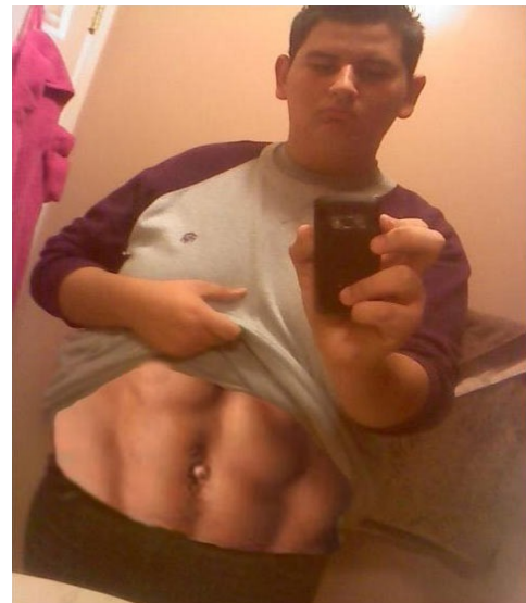
Figure 13: Attempt at Self Augmenting(Jordan, 2012)

The spreading of idealised imagery throughout Facebook almost resembles the dissemination of the idealised male form in popular media. Instead of upward comparisons to male models or actors, people are comparing themselves to digitally enhance versions of their friends. Social comparison theory affirms that peers are relevant comparison targets, and those with low levels of body satisfaction are more likely to internalise an idealised body shape upon viewing idealised imagery.