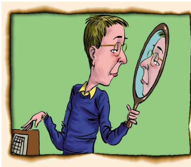
Figure 10: Illustration of Narcissism (Mohanji, 2013)

Narcissism is measured through the Narcissistic Personality Inventory(NPI) in social psychological research.