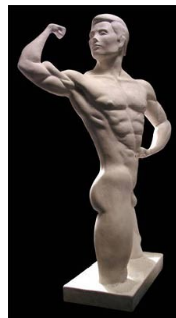
Figure 1: Adonis Statue (Granit, 2014)

The Adonis Complex is a complicated term that encompasses a wide array of body image preoccupations among men and young boys. The name is derived from Greek mythology, where Adonis was a half god, half man and the ideal in masculine physical perfection (Pope and Phillips et al., 2000, Pg. 6). Preoccupations vary depending on each individual, for example, some may worry they aren't muscular enough, while others feel they may need to cut weight, others simply focus on body features they deem to be unattractive. The complexity of the disorder is represented by the assorted obsessions derived from its affliction. It is considered a sub-category of muscle dysmorphia as the complex deals with specific male body image concerns, muscle dysmorphia can affect women as well as men (Darkes, 2013). The problem is ostensibly compounded by the besiege of idealised masculine perfection in media imagery, and the capitalisation of supplement companies promising a solution to image insecurities. Men are caught in a double bind whereby they are trapped between the impossible, media projected ideals, and restrictions presented by the taboo of expression. (Pope and Phillips et al., 2000, Pg. 5).