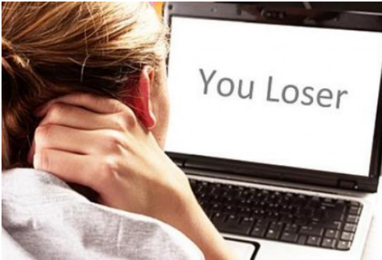
Figure 14: Illustration of Cyberbullying(Joseph, 2013)

This is why cyberbullying is so prevalent amidst social networking sites, individuals often take actions that are consistent with the bureaucratic architecture. Social learning theory contends that those who are inherently contentious hold a higher social rank, enforcing the act