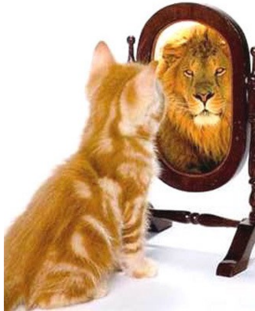
Figure 11: Illustration of Self Comparison(Leng 2013)

A correlation between general contentment and social media was analysed by the Public Library of Science, as described by The Economist(2014). They concluded that those who engaged with social media had diminished satisfaction and fulfillment with their day to day life. 82 teenage participants filled the sample and were observed over a two week time period. Each member reported their emotional patterns throughout the day, specifically during the instance of Facebook engagement. Analysis of the concluding data implied that frequent Facebook visitation correlated with a drop in overall life satisfaction. The most prevailing characteristics equated with recurrent use of the site were social tension, jealousy and isolation, potentially compounding other negative aspects of the site (The Economist, 2014). A contraction of the vitality associated with a fulfilling life can conceivably contribute to the leeriness surrounding body image insecurities, further correlation will be explored in the next chapter.