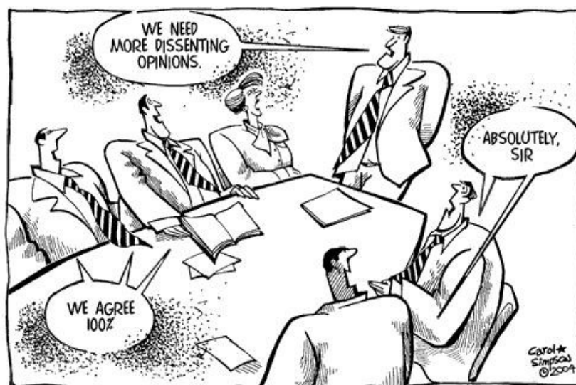
Figure 9: Illustration of Groupthink(anticap, 2014)

In Victims of Groupthink , Janis(1972, Pg.73) describes the groupthink phenomenon as “a deterioration of mental efficiency, reality testing and moral judgement that results from in-group pressures”(Figure 9). Written over four decades ago this statement is never more relevant than in the social media driven world we live in today.