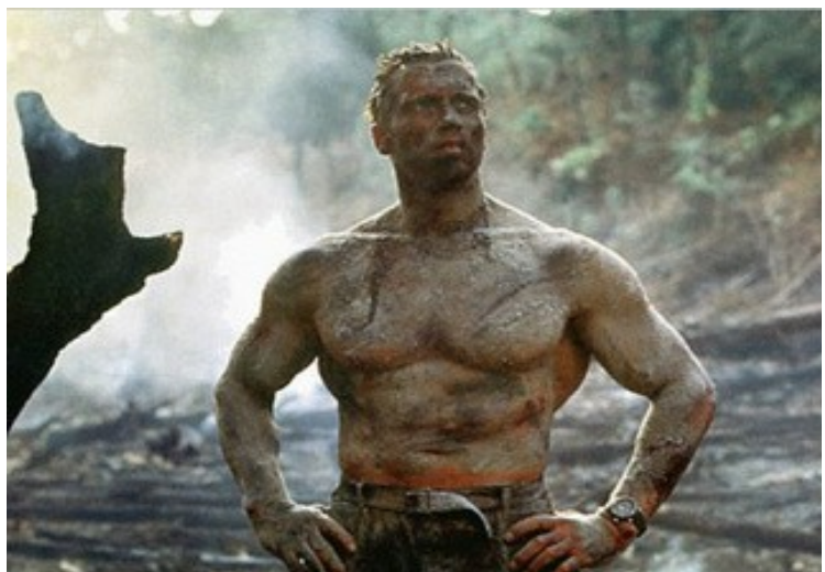
Figure 2: Arnold Schwarzenegger – Predator(1987)

"where the idea of real men as decisive strong and courageous rose from the humiliation and confusion of the U.S. loss in the Vietnam war"(Messner, 2004, Pg. 464). One such iconic figure was Arnold Schwarzenegger, who got his big break with the critically acclaimed documentary Pumping Iron (1977). The seven time Mr Olympia champion went on to forge a successful movie career,