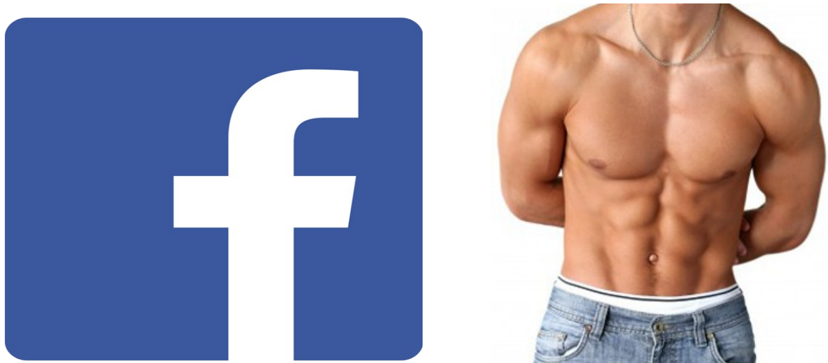
Figure 12: Facebook Icon & Muscular Physique(sneakerscafe, 2014)(Mens Health, 2012)

The intent of this chapter is to establish whether Facebook has the capability of influencing the male body image, by way of amplifying the Adonis Complex. Pertinent information deriving from the previous chapters will be juxtaposed and contrasted in order to ascertain the degree of the interrelationship between the two. Applicable theories concerning the representation of the self and an individual's surety in their physicality, will be applied in order to determine if the manner in which one is depicted, has the propensity to impact upon their body image. Through this process it will be disclosed whether Facebook is feeding the Adonis Complex (Figure 12).