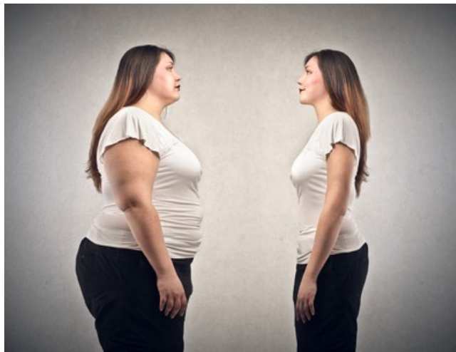
Figure 15: Illustration of Self Discrepancy (dietachudnutie, 2013)

It has been demonstrated how Facebook can negatively affect an individual's self esteem. Self discrepancy theory is pertinent in terms of body image, due to the exposure of the self to idealised images, whereby the individual falls short of their idealised self, conjuring negative emotions. In terms of body image, analysts customarily focus on how one distinguishes themselves (actual self) and how an individual would prefer to be regarded (ideal/ought self) (Vartanian, 2012, Pg. 711). Acknowledging the conceivable internalisation