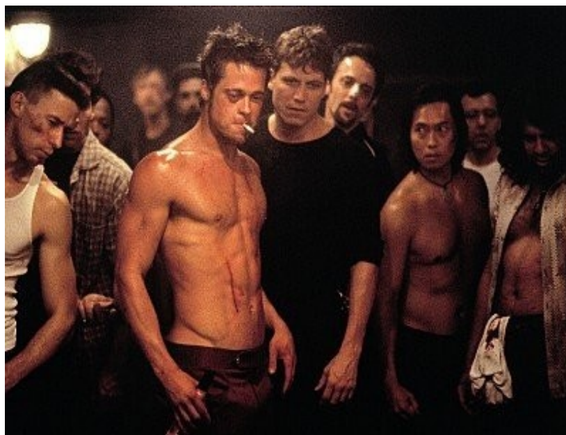
Figure 3: Brad Pitt - Fight Club (1999)(Mehdi, 2008)

The late 1980's and early 1990's heralded a media consumer that had grown weary of the brash macho persona created by the archetypal Hollywood heroes. Obvious bulk and ultra masculinity were accosted with the irony synonymous with Generation-X. The 90's saw a shift of the quintessential male form, from that of over muscularity, to that of leanness complemented by muscle. Brad Pitt became the perfect specimen, an almost Adonis like figure, with the ideal combination of muscularity and definition. The iconic image of Pitt in the movie Fight Club (1999) added to the objectification of men in the media at the time (Figure 3). Throughout the movie, a shirtless Pitt shows off his physique, which quickly became the most sought after body according to Men's Health magazine (Mazinani, 2011). Pitt's character Tyler Durden sums up the growing internalisation of body image ideals, and social comparison that the 90's male began to observe. As Durden boards a bus he is confronted by an advertisement featuring a perfectly sculpted male body, he asks, "is that what a real man is supposed to look like?"(Seed, 2006).